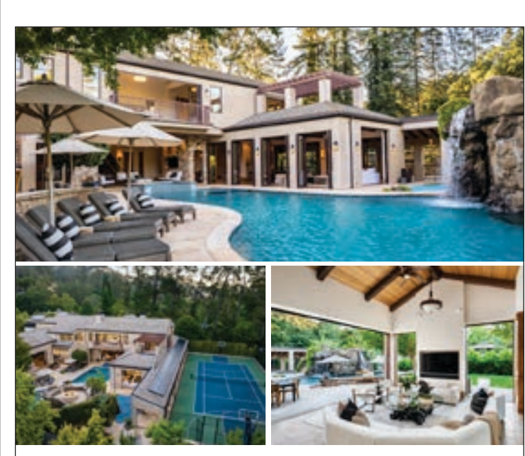
3941 Happy Valley Road, Lafayette 4 Bedrooms | 5.5 Bathrooms | 8,620 ± sq. ft. | 2.3 acres $9,950,000 | 3941HappyValleyRd.com